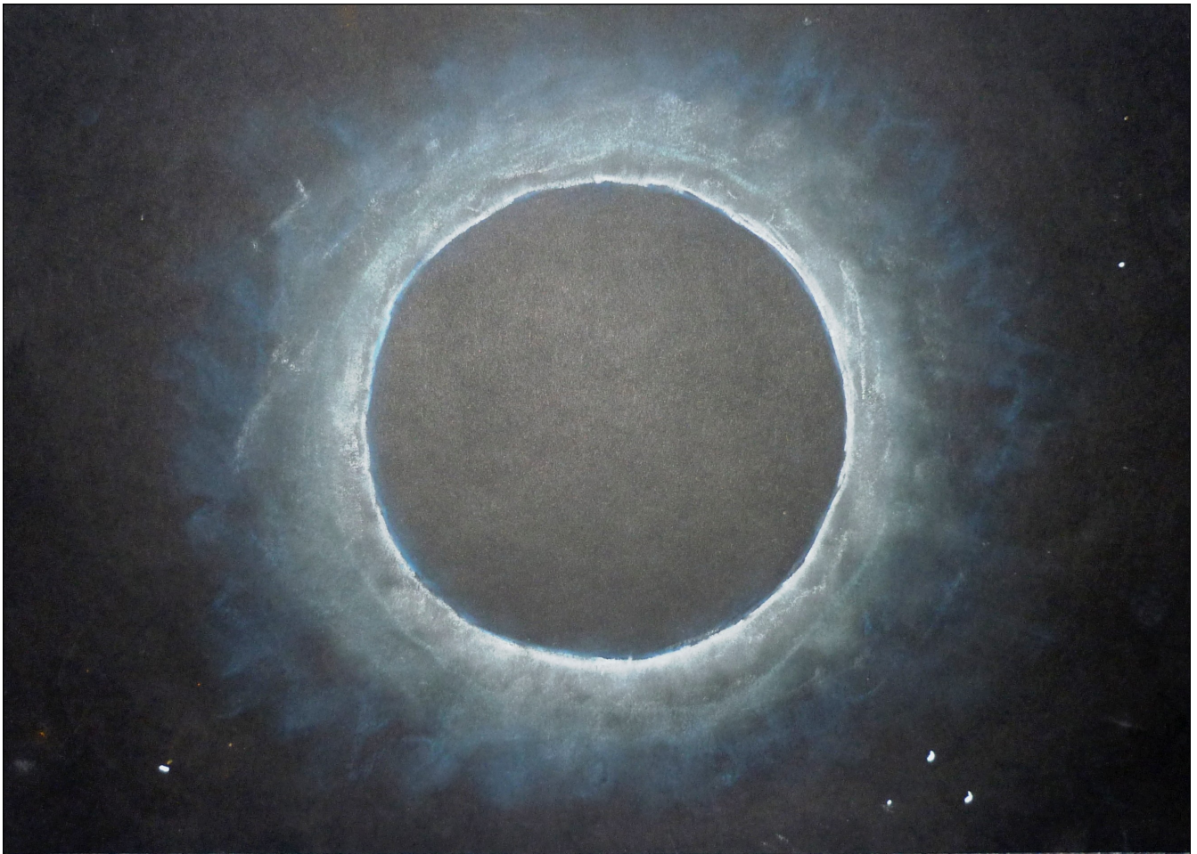
"Eclipse" - Skye, Class 6