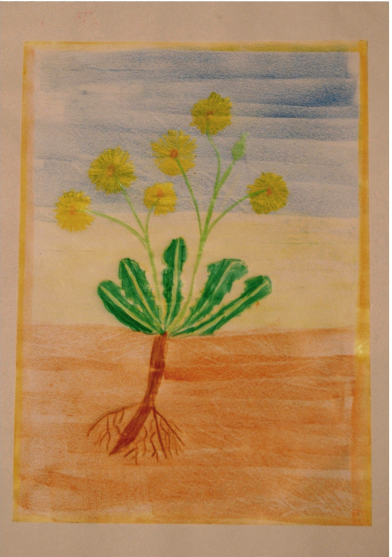
"Dandelion" - Tomiah, Class 5