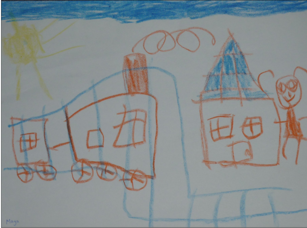
"A Train to Catch" - Maya, K/F

Front cover: "Life Along the Nile" Bethany, Class 3