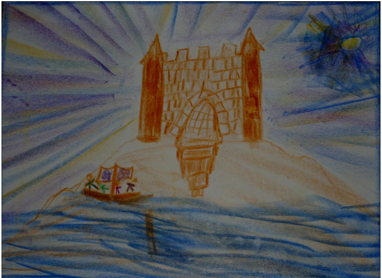
"Mael Duin arrives at the Castle" - Shou, Class 2