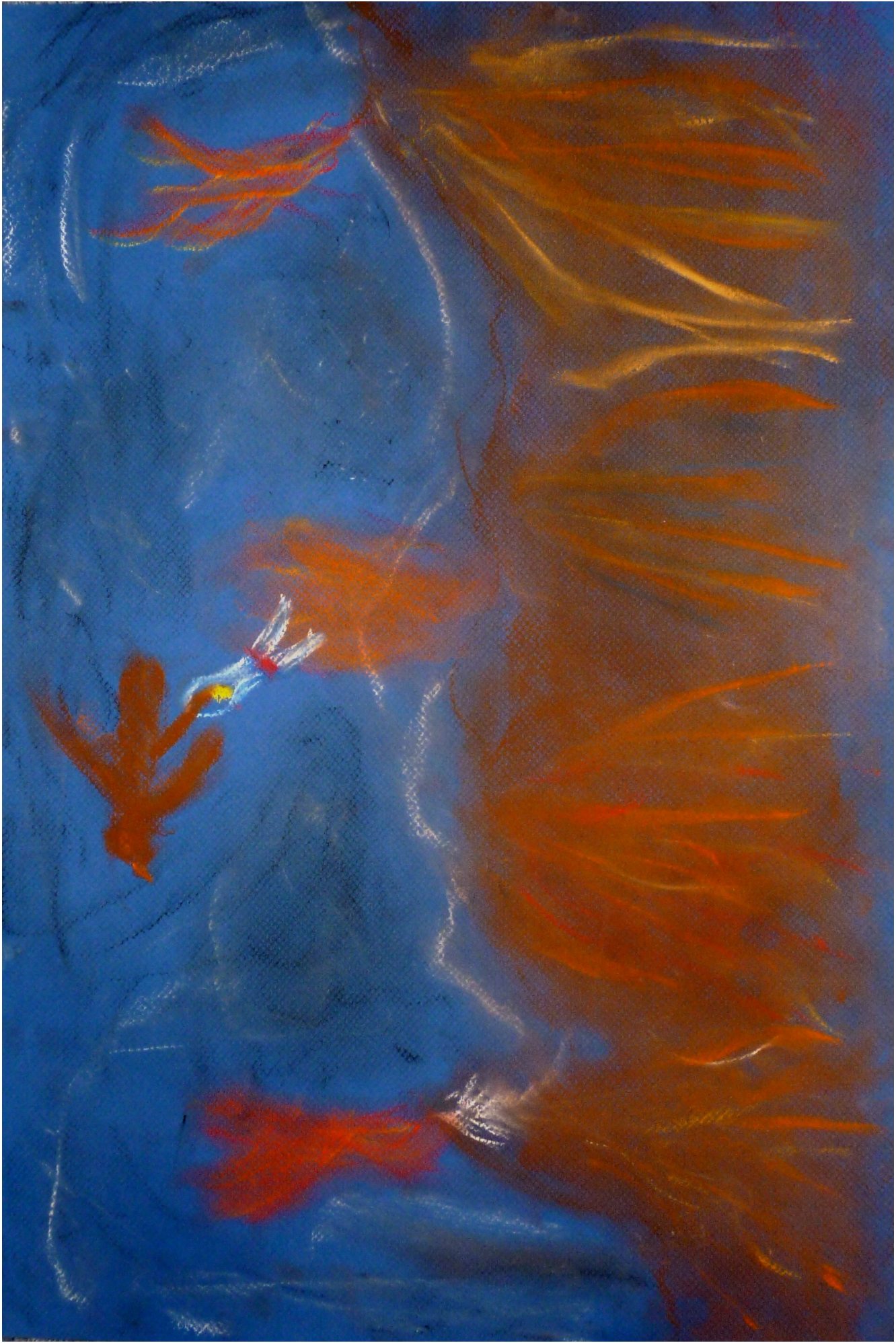
"Thiassi and Loti in Jotenheim" - Khai, Class 4