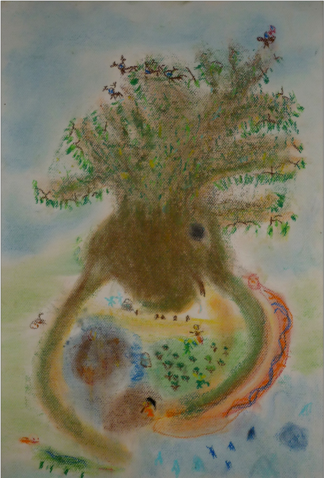
"Yggdrasil Tree" - Kyle, Class 4